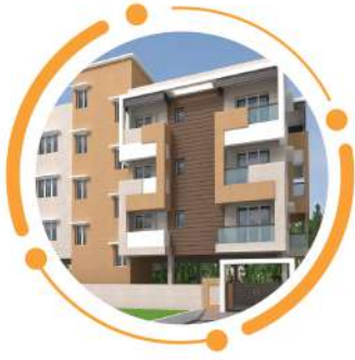
Shallow Plot No: 15, Bhavani Nagar, Kolathur, Ch - 600099. Flat starting from 981 sq.ft