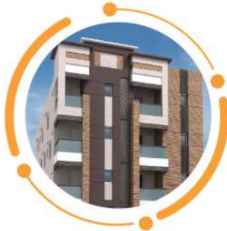
Apsara No. 208 periyar Nagar 9th street TNHB, Korattur, ch-600080. Flat starting from 800 sq.ft