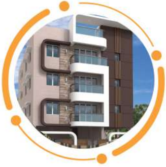
Sunshine Plot No.31, 2nd street, Cauvery Nagar, Saidapet, Ch - 600015. Flats starting from 865 sq.ft